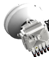
UBT-T with integrated antenna